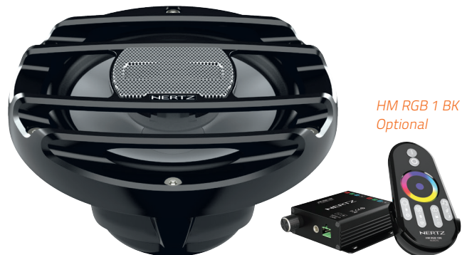
HM RGB 1 BK Optional